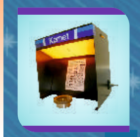
CUSTOMIZED SEALS & SEAL FACES